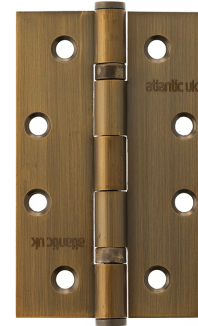
Product Finish Pictured: MATT ANTIQUE BRASS (MAB)